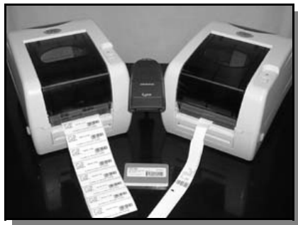
Label Station & Wristband Station

Easy To Read ~ No more unreadable imprints on your patient documents. You get crisp, clear labels and wristbands with or without bar-codes anytime and anywhere you want.